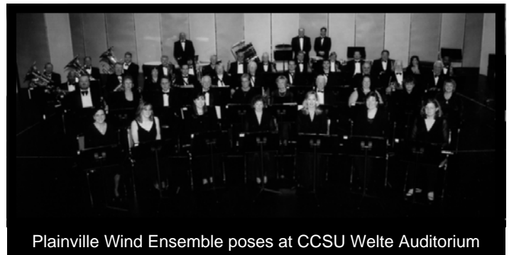
Plainville Wind Ensemble poses at CCSU Welte Auditorium