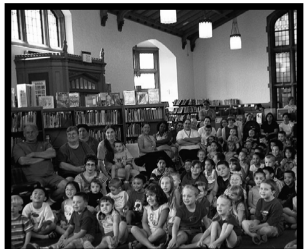
Children's Department New Britain Public Library, new home to the Benjamin Franklin School Paintings

you can come to the dedication or stop by during normal Library hours to see these wonderful artifacts of New Britain art history.