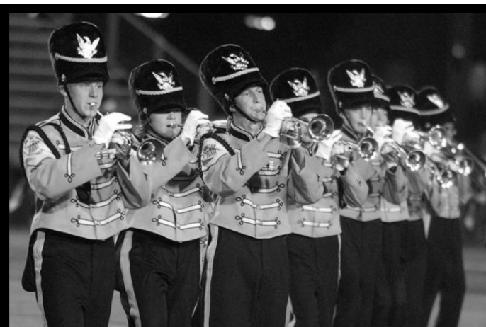
Trumpeters from the New Britain High School Golden Hurricane Marching Band

New Britain High School Golden Hurricane Marching Band has been renowned for many years. An emphasis on musical instruction starts long before High School in the New Britain School District. The Hurricane Marching Band has been so good for so long precisely because so