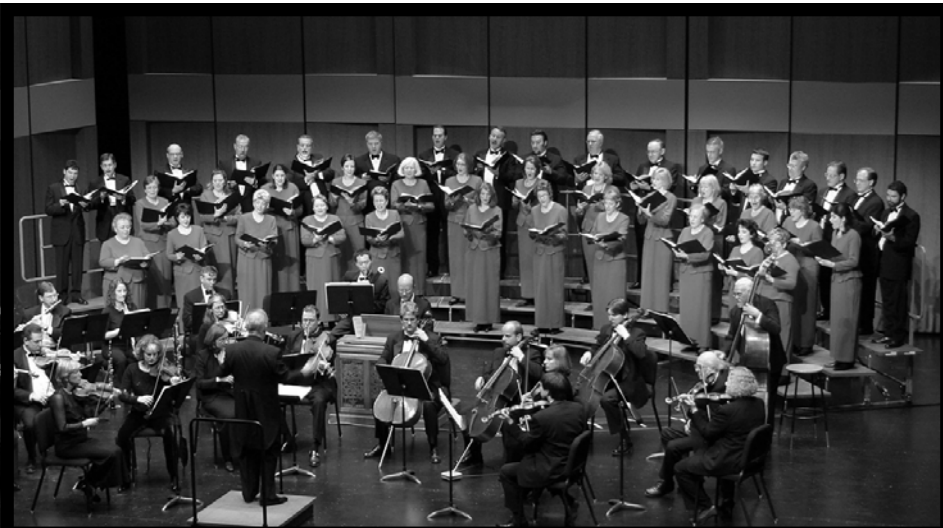
CONCORA performs at the Belding Theater at the Bushnell Center in Hartford

The Arts Alliance is continually looking for ways to strengthen area arts without adding to the financial burden on artists and arts organizations. We are very grateful to all those who make our work possible especially our major funders who in addition to the Community Foundation of Greater New Britain and American Savings Foundation includes TD Banknorth Charitable Foundation, the City of New Britain, The Herald, and the Hartford Advocate.