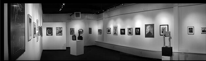
Downtown Gallery